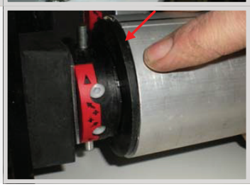
STEP 8. Replace rubber block using a 4mm Allen Key

STEP 9. Replace door stop using a 4mm Allen Key