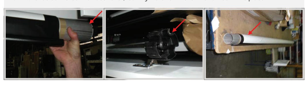
STEP 6. Slide the replacement screen surface and tube over the motor, making sure that the tape on the motor drive lines up with the key way in the screen surface tube. (Shown in pictures below)

STEP 5. Slide out screen surface roller, leaving motor on the left hand side in the place.